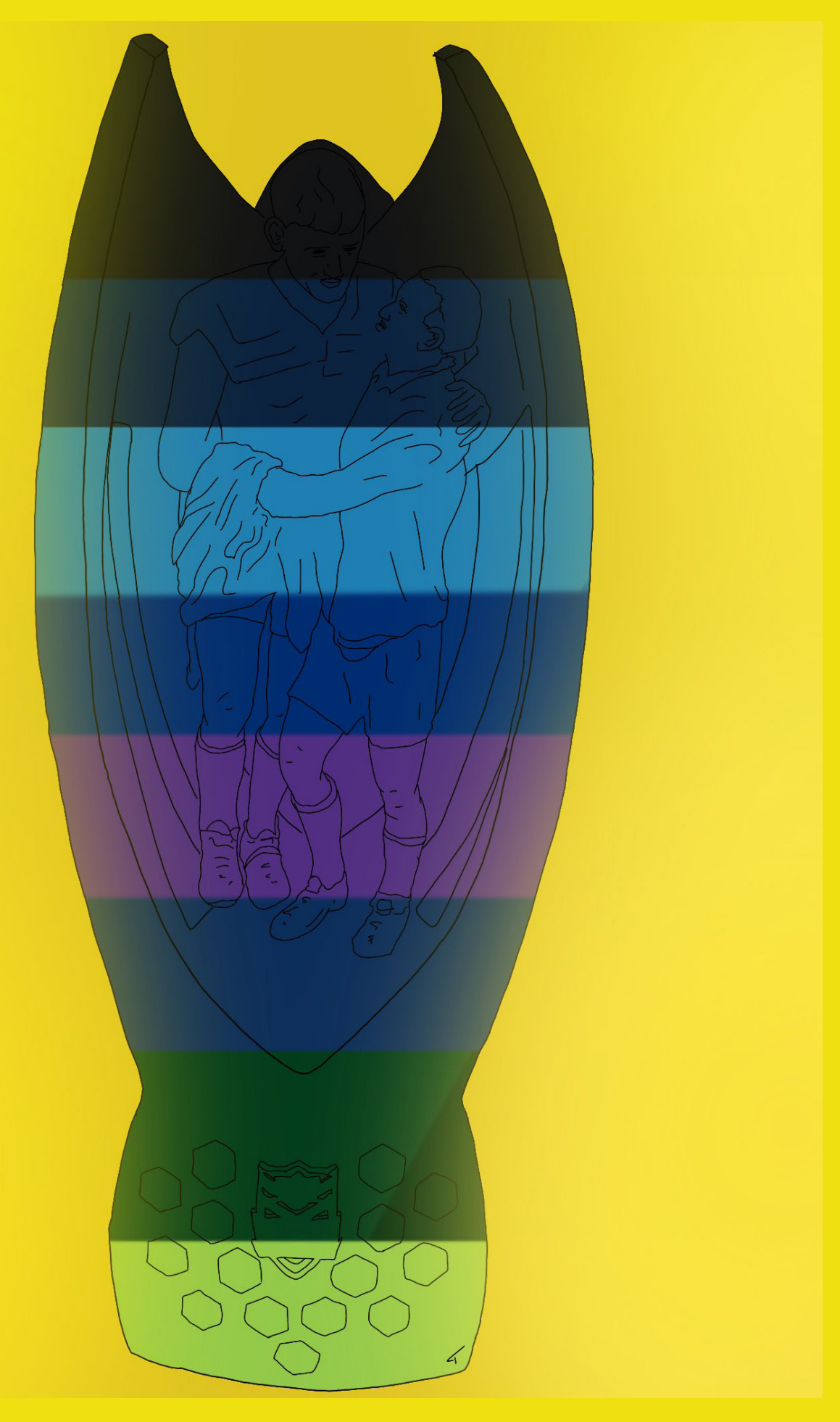
ILLUSTRATION BY THE BIGGEST TIGER