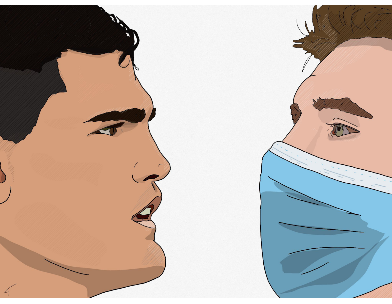
ILLUSTRATION BY THEBIGGESTTIGER

CAMERON MUNSTER MIGHT HAVE BEEN SIDELINED WITH COVID-19 - BUT EVEN FROM HIS COUCH HE HAD THE LAST LAUGH OVER CLEARY'S BLUES IN AN EPIC ORIGIN DECIDER.