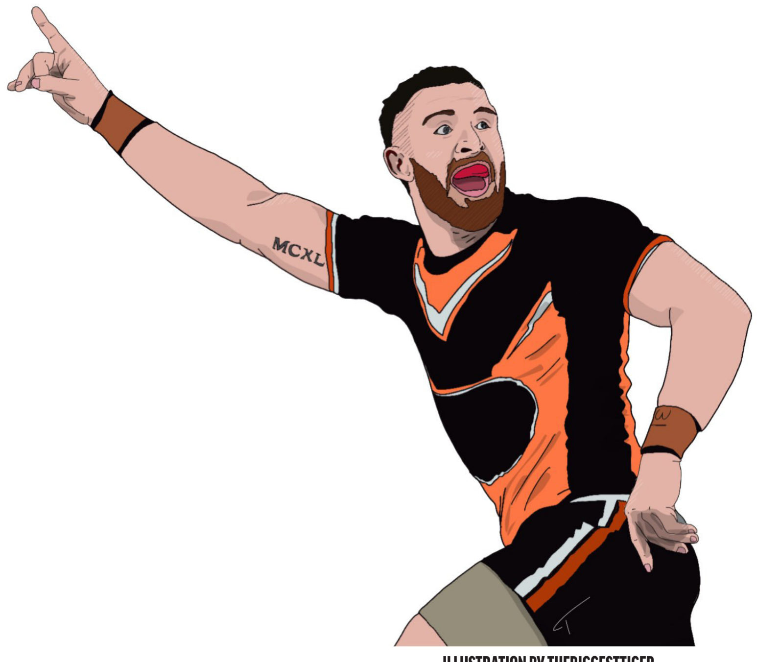
ILLUSTRATION BY THEBIGGESTTIGER

JACKO'S BACK! HASTINGS' EASTER MONDAY MIRACLE DELIVERS TIGERS VICTORY