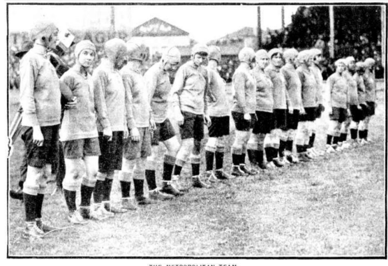
THE METROPOLITAN TEAM.